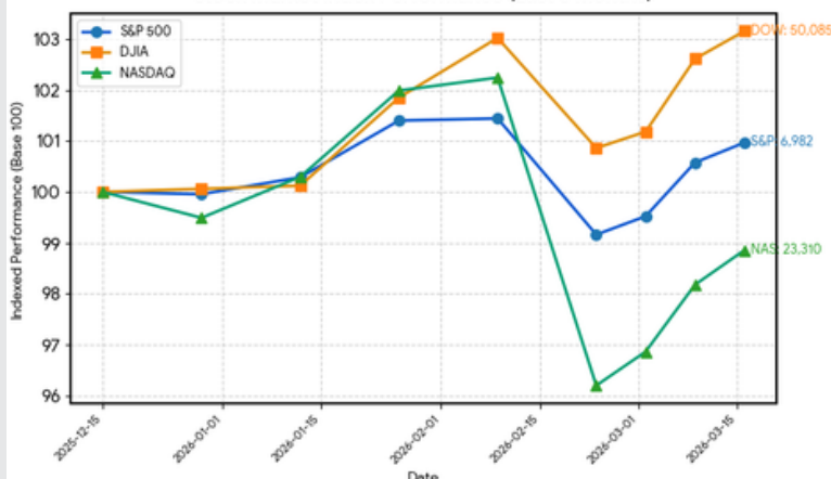
Stock Market Index Performance (Last 3 Months)